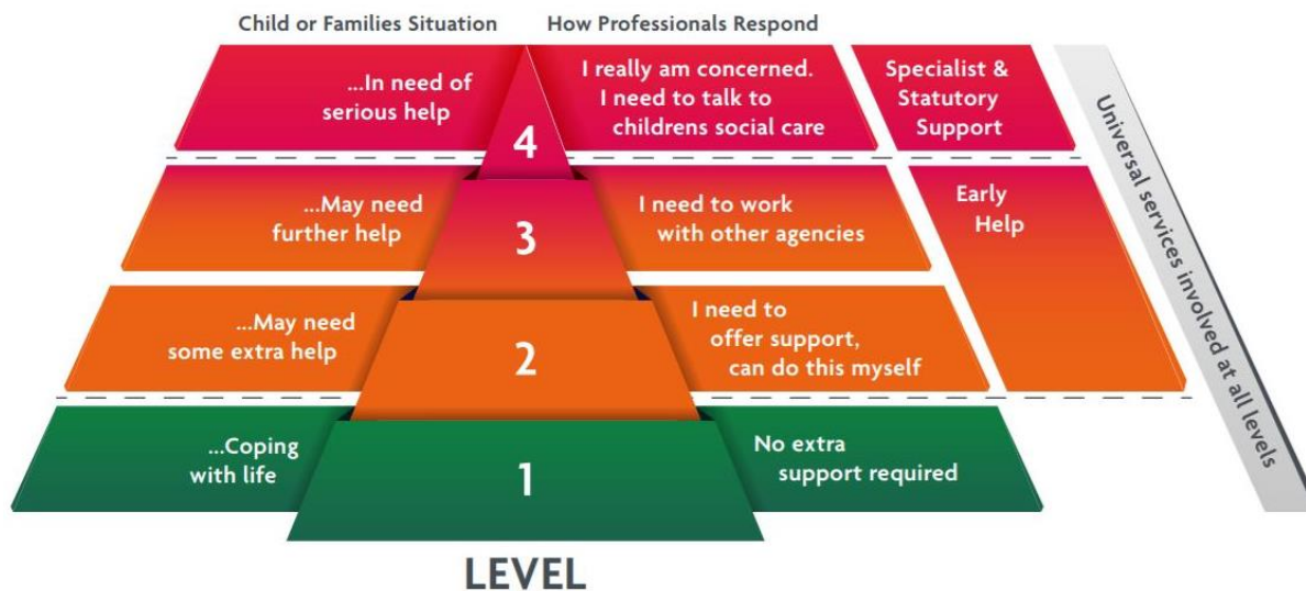
Figure 1: Levels of Need

The following diagram, known as the continuum of need, illustrates how a child’s needs can move forwards and backwards across the continuum, highlighting the importance of coordinated service delivery. It also reinforces the importance of effective, seamless processes to ensure continuity of care when a child or young person requires different levels of support. It is important to note that information, advice and guidance should be available to children and families at all levels of need. This is now available on line from Worcestershire Council via its Your Life, Your Choice website: www.worcestershire.gov.uk/ylyc