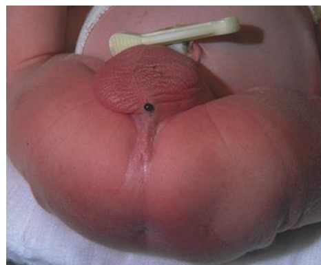
Figure 2: Fistula opening onto scrotal raphe