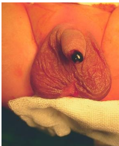
Figure 3: ARM with a fistula to the urinary tract

Once diagnosed boys should be kept nil-by-mouth, have an IVI and urgent transfer for surgery