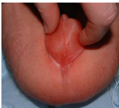
Figure 1: Anus is absent